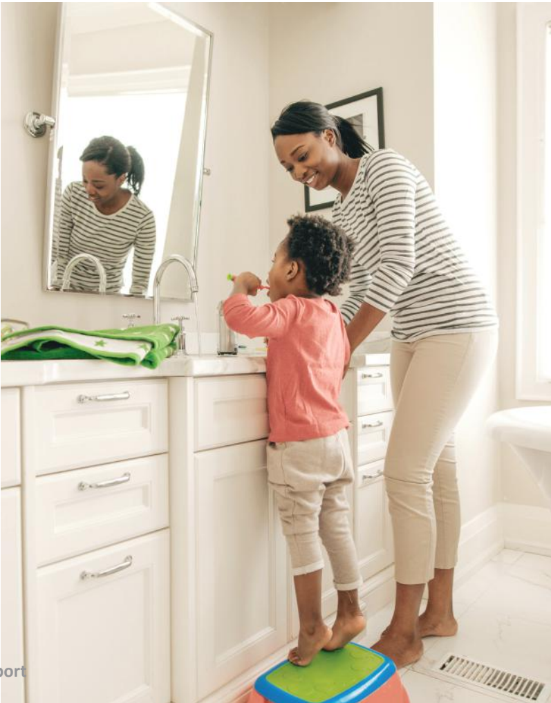
In 2021, our wholesaler conducted a second round of voluntary monitoring using a newer analytical method adopted by the USEPA for some other PFAS contaminants.