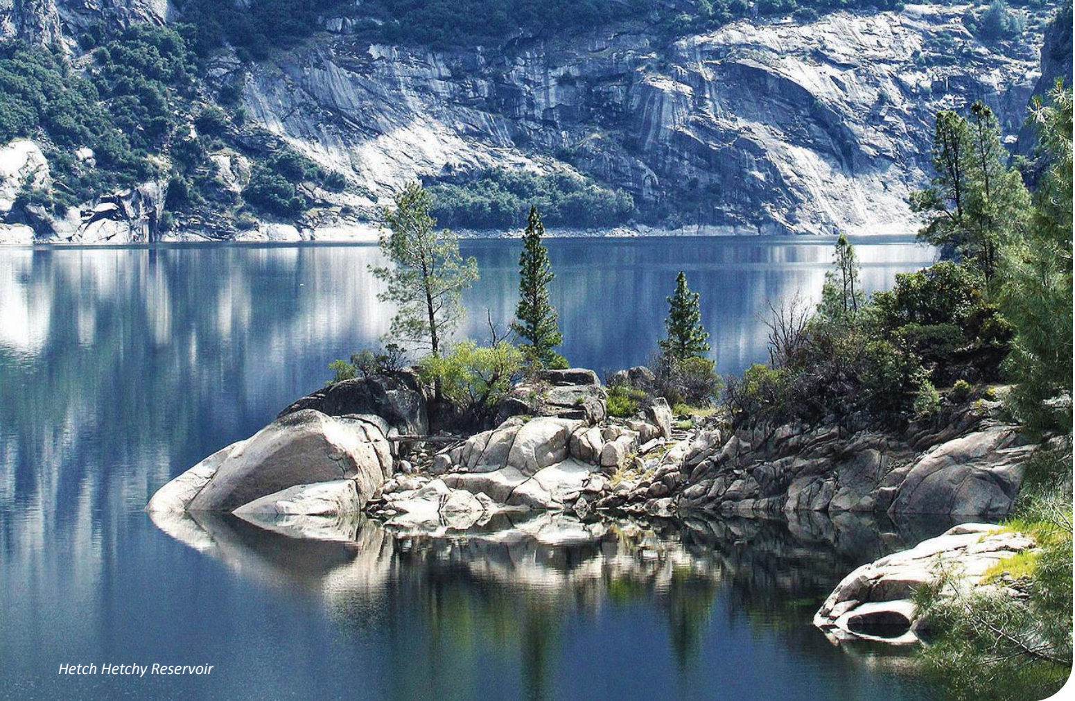
Hetch Hetchy Reservoir