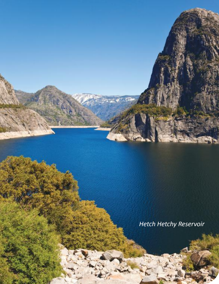
Hetch Hetchy Reservoir

High quality is one thing, but high quantity is another. Calendar year 2021 was the driest in state history. The lakes and rivers that bring water to our community were depleted and stressed as never before. Heavy snowfalls late in the year gave all of us hope, but they were preceded and followed by months where little to no measurable precipitation fell. Once again, our state is in the middle of a drought emergency.